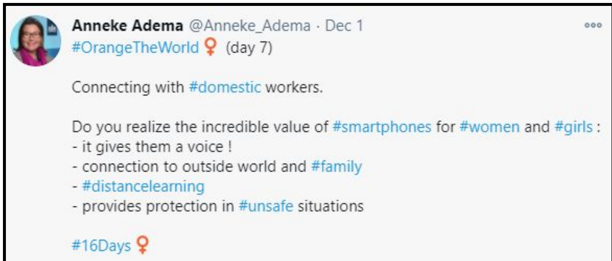
Image Caption: A Tweet from the Dutch Deputy Chief of Mission on her reflection and learning from the discussion with women and children