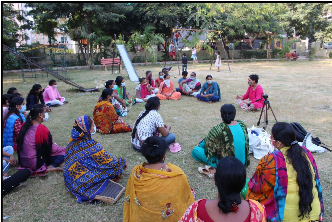
Image Caption: Women domestic workers discuss lockdown challenges and the need for a mobile phone with every woman and school-going or working child in the community with MFF

During this time, the role and importance of a mobile phone became prominent, in not just accessing emergency services, keeping in touch with one another, but also took precedence in public discourse in relation to education, with particular emphasis on girls' education.